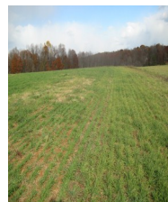
Cover Crop installed with a no-till drill