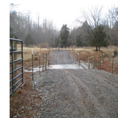
Stream crossing that also serves as the livestock's water source