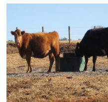
Cattle drinking from an alternative watering facility